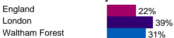
Chart 1. Proportion of workers on zero hours contracts by area

Around a third (31%) of the workforce in Waltham Forest were on zero-hours contracts. Around half (53%) of the workforce usually worked full-time hours and 47% were part-time.